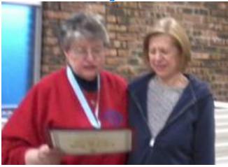
Lady of the month